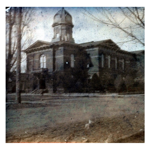
Old Wasco County Court House -