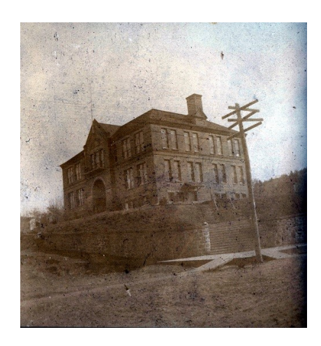
Old Academy - The Dalles