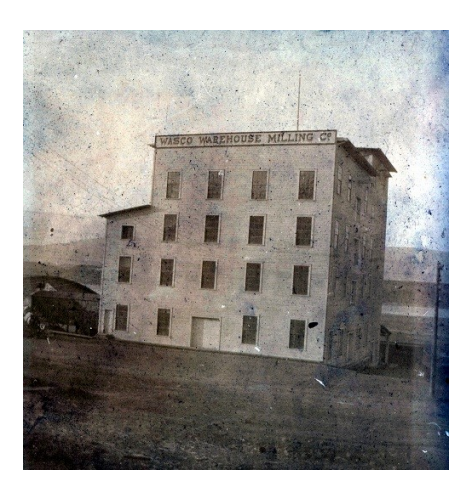
Wasco Warehouse Milling Co.