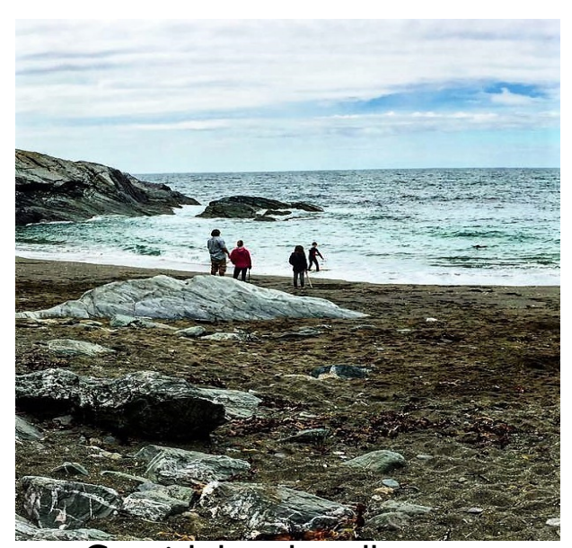
Cornish beach walk

Meet others of Cornish descent Cornish Materials Use the PNC Society library Meet Cornish people from all over Learn Cornish culture Gain access to Cornish genealogy Taste a pasty Learn Cornish songs Link to other Cornish groups Share travels experiences.