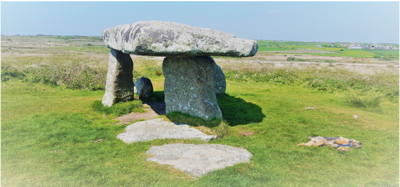
Lanyon Quoit near Morvah in West Penwith

One of the oldest and probably most photographed ancient sites in West Cornwall. Dating from about Over 10000 BC to 2000 BC, this Quoit or Cromlech was constructed during the Late Mesolithic to Early Neolithic period. It is situated beside the Morvah-Madron road just northwest of Madron Holy Well at Grid ref. SW446328 and lies