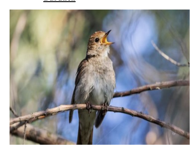
"The Nightingale sings" a song sitting in the crown of trees wild nature