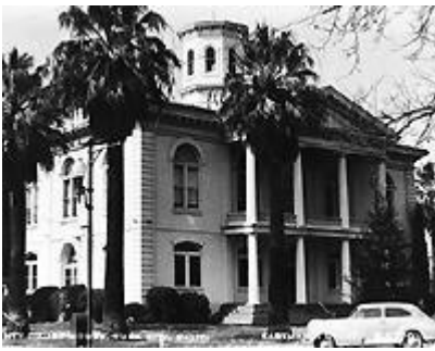
Sutter County Courthouse Completed 1900