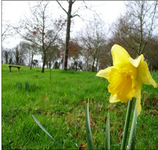
One of the first daffodils of 2013, spotted on the west lawn at Heligan the morning of January 13.