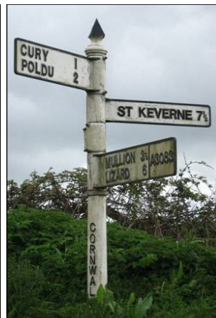
Old cast iron road signs