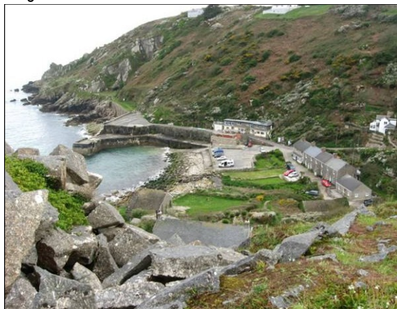
Lamorna from above