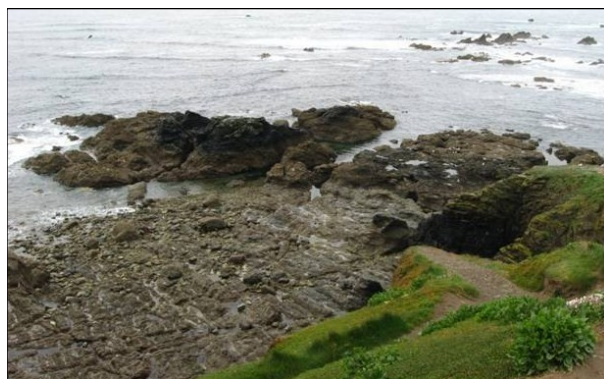
The Lizard Point