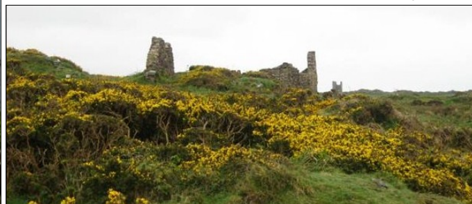
Bollack stamping works with a field of gorse