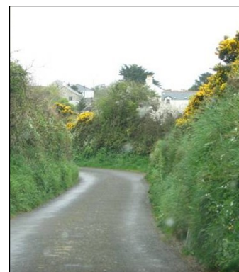
Gorse by the roadside