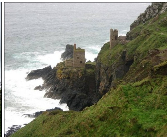
Crown Mine at Botallack