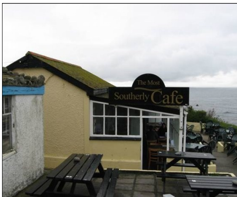
England's southernmost café