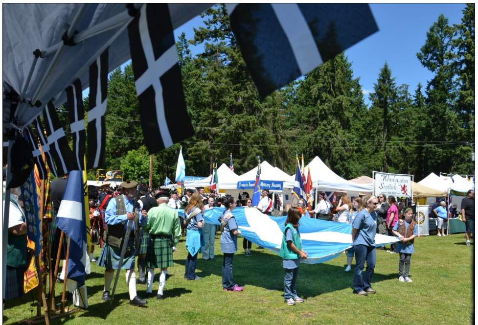
Girl Scouts carry the Flag of St. Andrew past the PNCS booth at the Tacoma Highland Games.