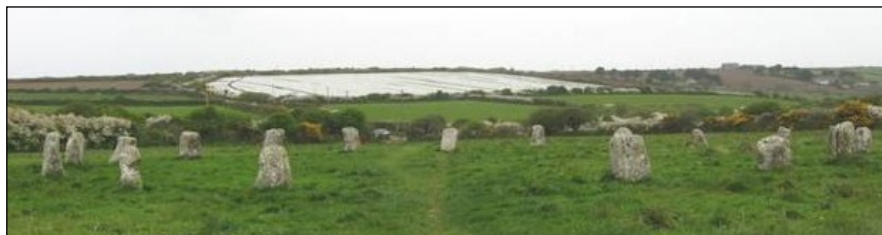
The Merry Maidens stone circle