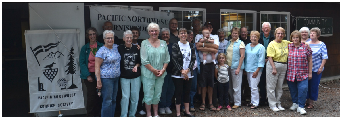
Members and guests of the Pacific Northwest Cornish Society gather for the obligatory post-meeting photo at Fort Borst Park in Centralia Aug. 3.

(3) ✓ the guard of Honour the world is in a real Government now. - I fear the Bolsheviks will do a lot of mischief yet they are creeping in every where causing suffering & terror I hope they will keep out of England the weather is very wet & cold here We are only allowed 1oz of Butter a week the government