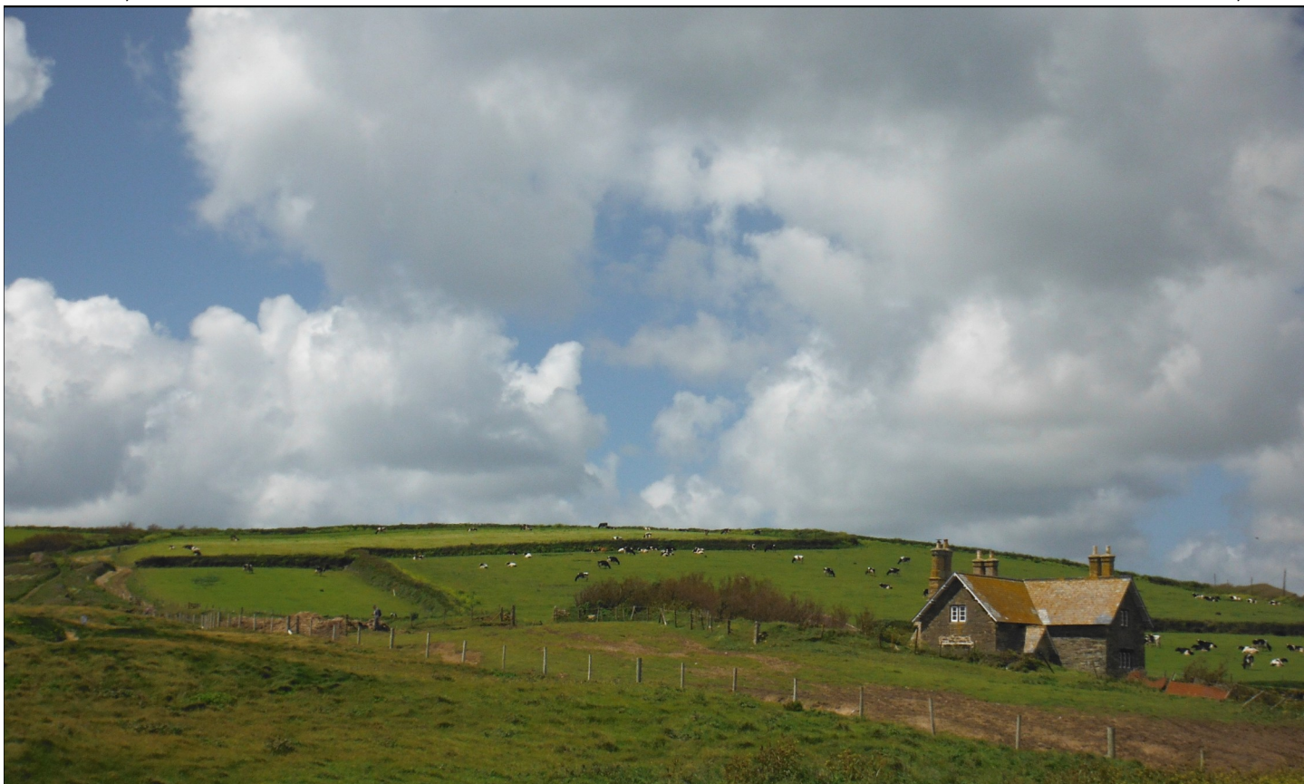
Farmhouse near the little town of Gunwalloe between The Lizard and Helston