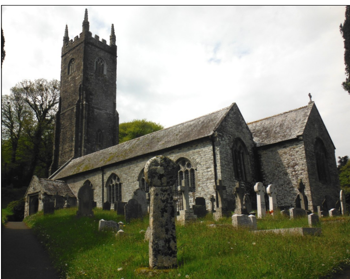
Ancient churches with their Celtic cross-filled graveyards, are part of Cornwall's charm.

Again, I’m left with amazing memories of my ancestral homeland. I know that you all appreciate what I mean. And, just maybe, I’ll be able to make that one last trip again!