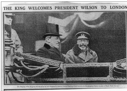
His Majesty with the guest we are all so much delighted to honour leaves Charing Cross Station for Buckingham Palace by way of Hyde Park Corner.

I suppose your papers have been full of President Wilson's grand reception here. Our King gave them a right Royal welcome. I think it is 150 years since some of the gold have been used. It was brought from Windsor Castle for the banquet. I wish the papers could be sent to the States. I should like to send you a few of the pictures of all the flags and bunting and the guard of honour.