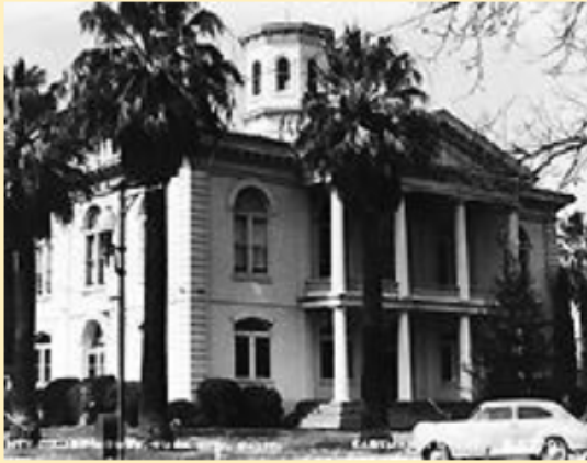
Sutter County Courthouse Completed 1900

This courthouse is the third built on the same site in Yuba City. The first, built in 1858, was destroyed by fire in 1871. The cause of the disaster, according to one news report, was "mice gnawing the heads of matches left in the office." A second and larger courthouse, completed in 1873, was also set fire, this time by "a Cornishman who was in custody awaiting commitment to the Stockton asylum." The current courthouse is an elegant replica of the second, built in the Classical Revival style and largely preserved in its original state.