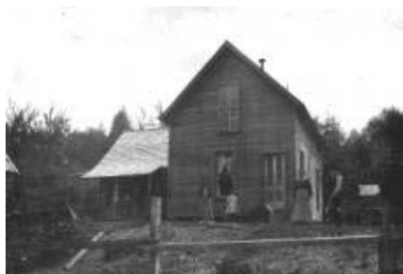
Kessell homestead in Grays River,WA