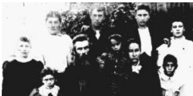
Kessell family about 1885