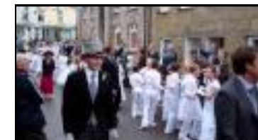
Children's Dance http://youtu.be/Eb4hc7Qxr1E