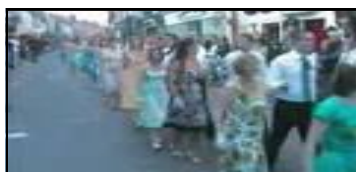
The First Dance http://youtu.be/P_Rm0IT-Nwk

Click on the thumbnail to open the video on YouTube. If that doesn't work, copy and paste the link into your browser