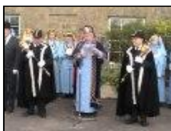
Gorseth Proclamation 2011 http://youtu.be/R_rmfTS8Ns