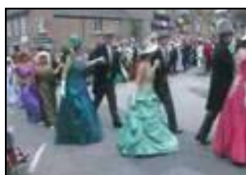
The Mid-day Dance http://youtu.be/xzNFTIKwk90