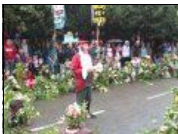
Hal en Tow http://youtu.be/q_fm_QkYVvQ