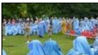
Helston Gorsedd 2011 http://youtu.be/1XtWvKdQ_Co