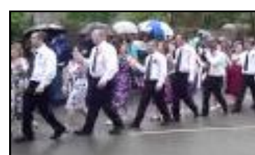
Flora Day 7 am Dance http://youtu.be/hu1zUt_tMQc