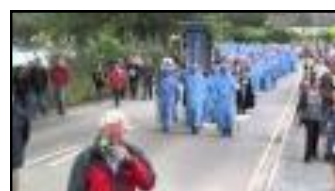
Gorsedh Kernow, 2011 http://youtu.be/UTHatAqt4V8