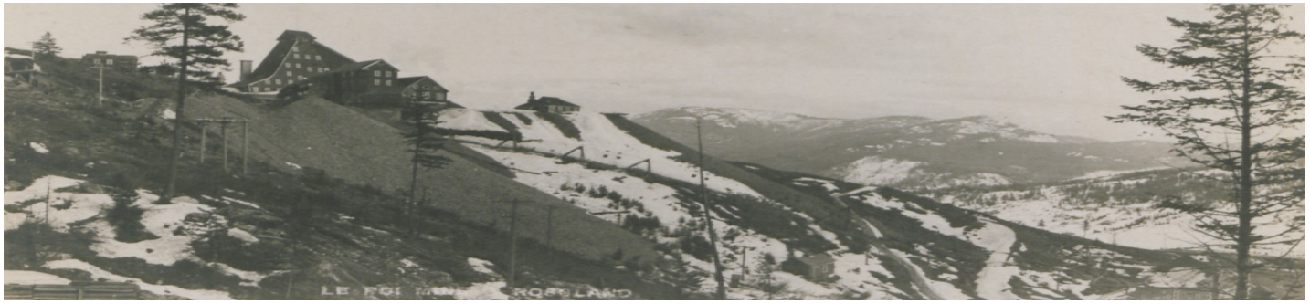
Le Roi, Mine—Rossland, B.C. 1909