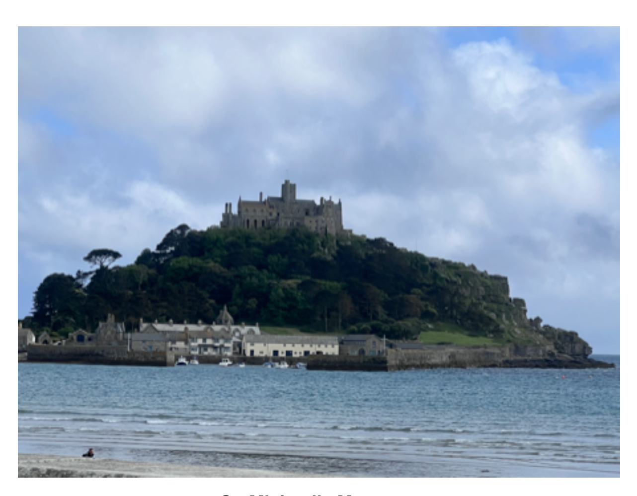
St. Michael's Mount