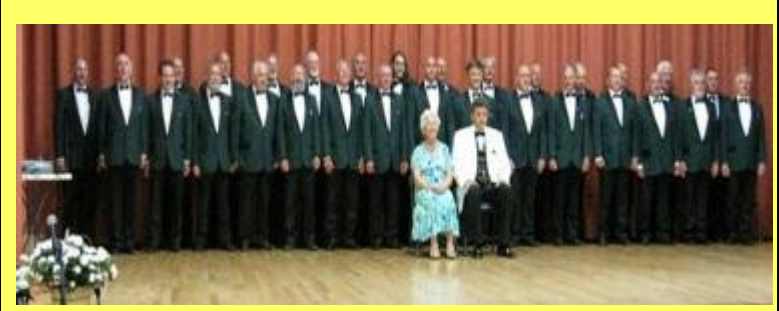
Marizon Apollo Men's Choir from Cornwall