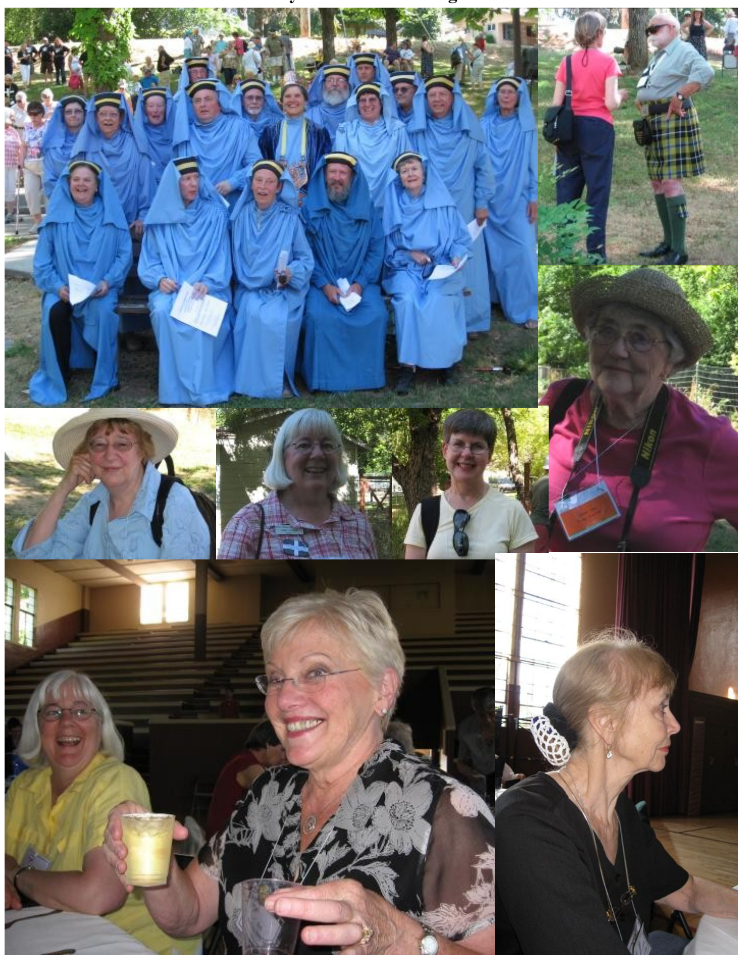
Grass Valley Cornish Gathering in Pictures